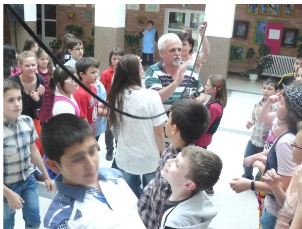
The students socialized, and had lots of fun during the party